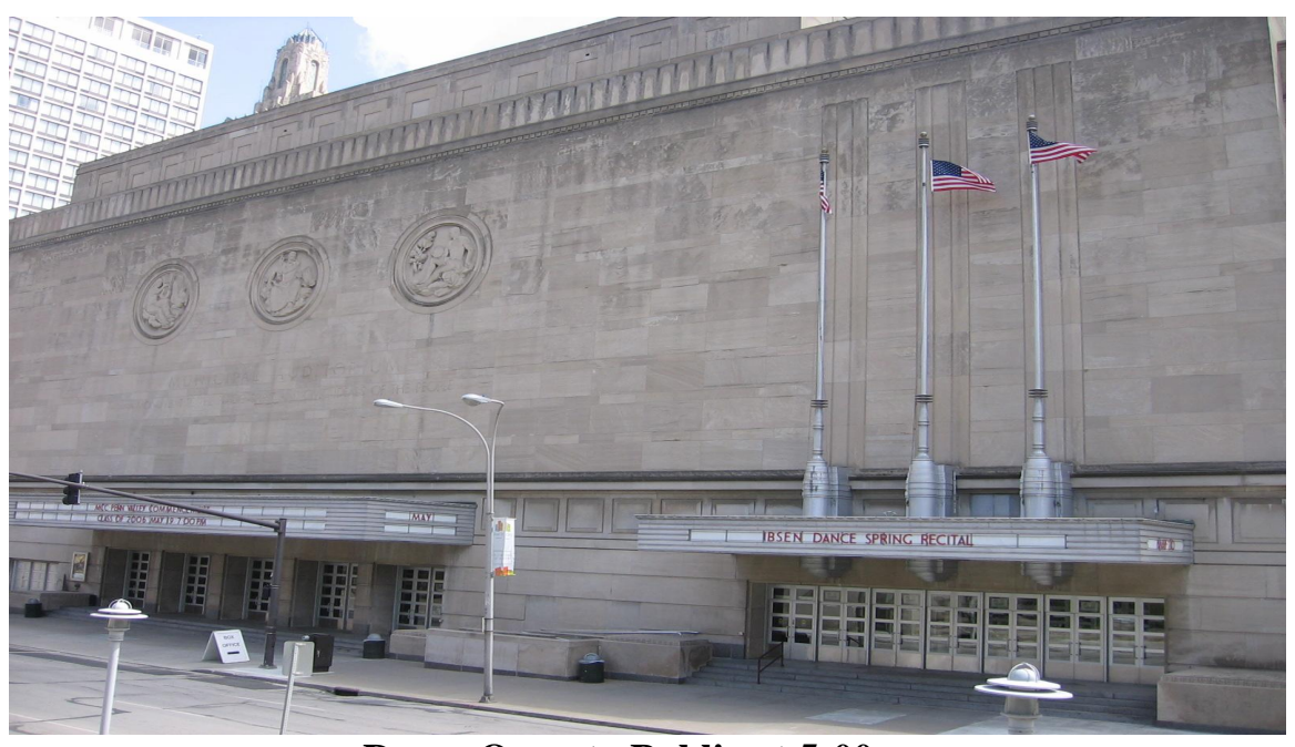
Doors Open to Public at 5:00pm

<u>All Athletes and Coaches must report to Exhibition Hall below the Arena floor by 6:00pm</u>- - DJ Entertainment, pin trading, and snacks for Athletes and Coaches in Exhibition Hall before and after Opening Ceremony.